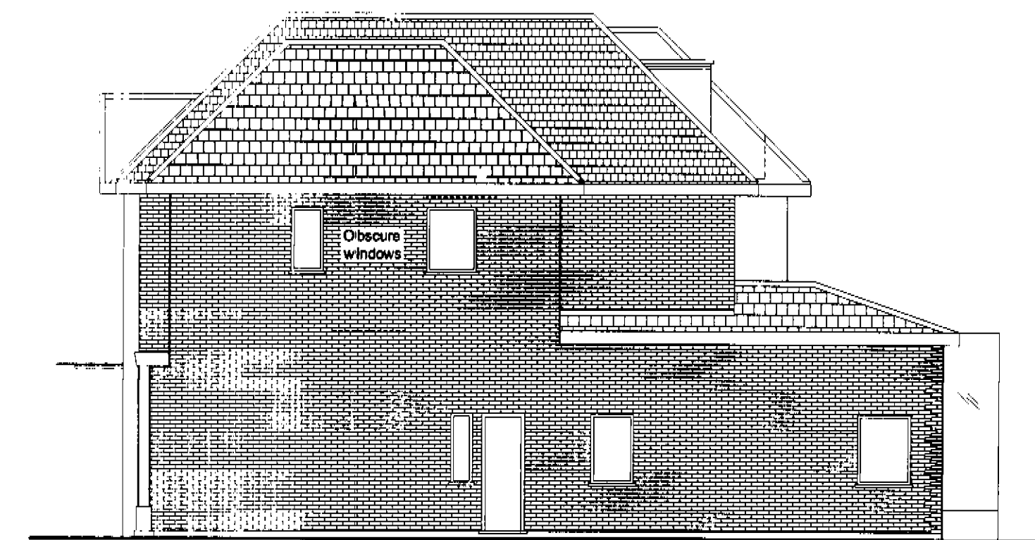
Proposed Side Elevation (Facing House No. 4) Scale 1:100

General Notes: Authorities (Planning Group or Building Control) might request for additional items / information to be added / revised. Contractor to report all errors, omissions and discrepancies. Contractor to verify all dimensions on site before commencing any work on site or preparing any shop drawings. All materials, components and workmanship to comply with the relevant British Standards, Codes of Practice and appropriate manufacturers' recommendations that form line to line shall apply. This drawing and design remains the property of Tal Arc Limited and may not be reproduced in any way without prior consent.