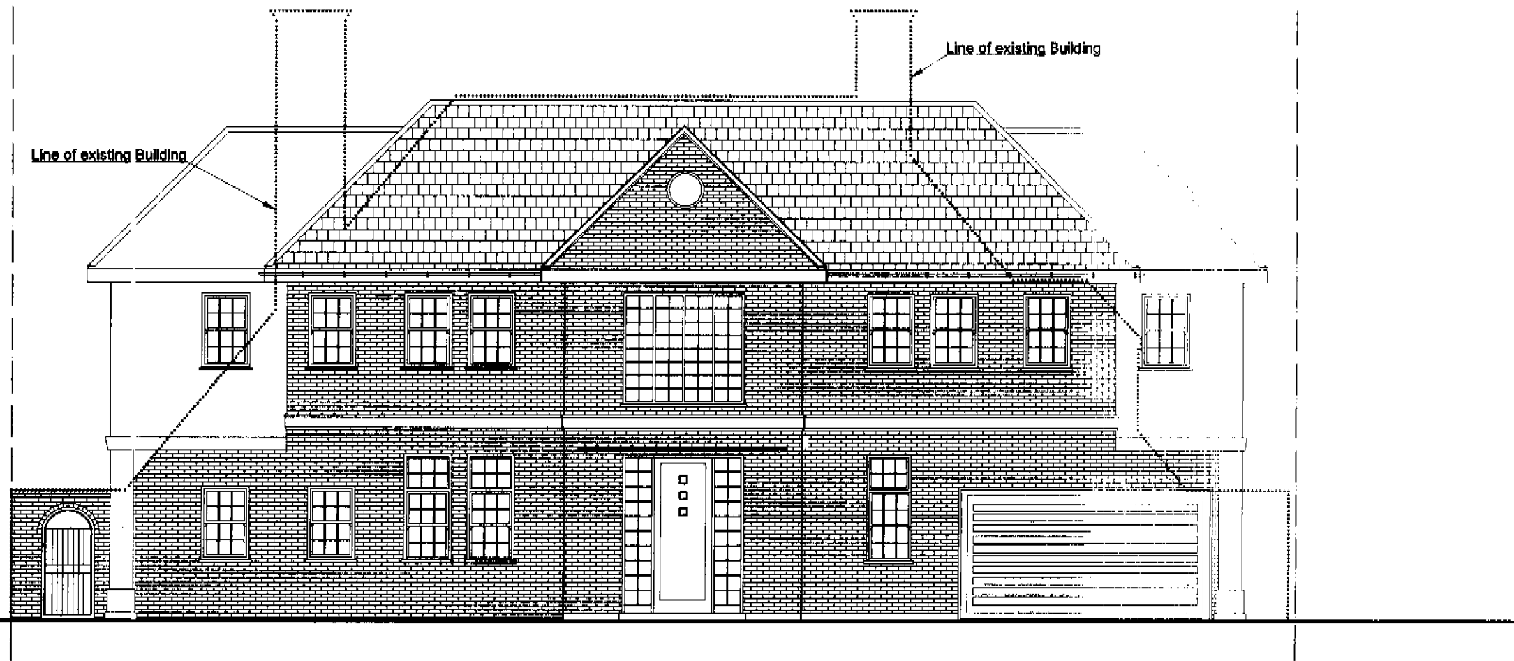
Proposed Front Elevation Scale 1:100