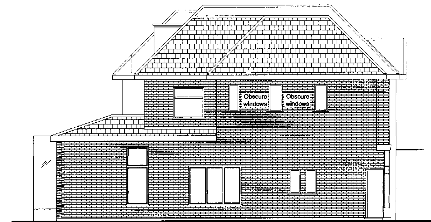
Proposed Side Elevation (Facing House No. 8) Scale 1:100