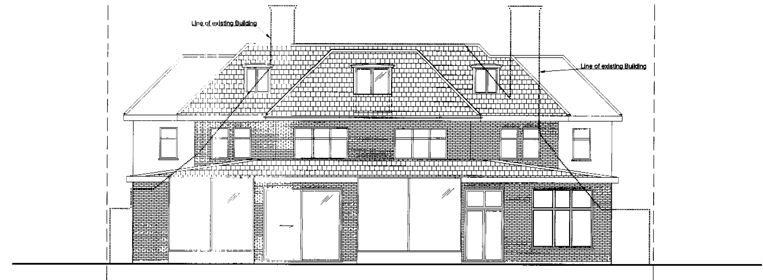
Proposed Rear Elevation Scale 1:100